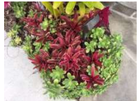
Color contrast: Neo danger with succulents