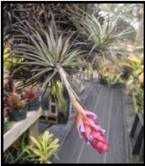
Tillandsia neglecta x stricta