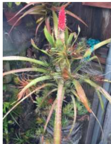
Aech. phanerophlebia wearing a myriad of tiny tillandsia

Vriesea platynema hybrids are beautiful. Neo. carcharodon and Aech. chantinii are too, but neither like it below 45. Salt tolerant and