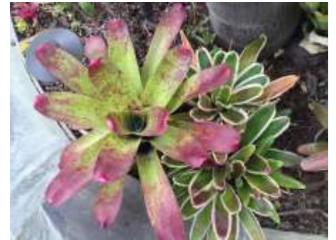
Neo correia-araujoi with neo Raphael

Patience is key. Sometimes a good plant only comes in the second or third generation. There were several occasions when I bought a pup only to see it develop into something that wasn't as pretty as the pictures of the plant in the internet. The plants we buy from professional growers are usually rushed into maturity with a lot of fertilizer. Dark green floppy leaves are common. Well, sometimes it takes more than a generation for a plant to adapt to your garden conditions and thrive. I have a clump of Hohenbergia castellanosii that didn't grow a leaf for two years, now