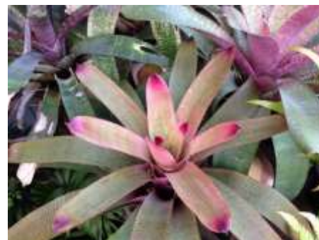
Vr. Platynema hybrid

If you don't have a shade house, knowing your garden microclimates is a fun challenge that takes some time and the ongoing seasonal shifting as shadows change. Know what plants are prone to crown rot and dump them out in the winter (heat-loving neos especially). If your garden is crowded like mine, don't neglect the importance of cutting and pulling all dead foliage (airflow