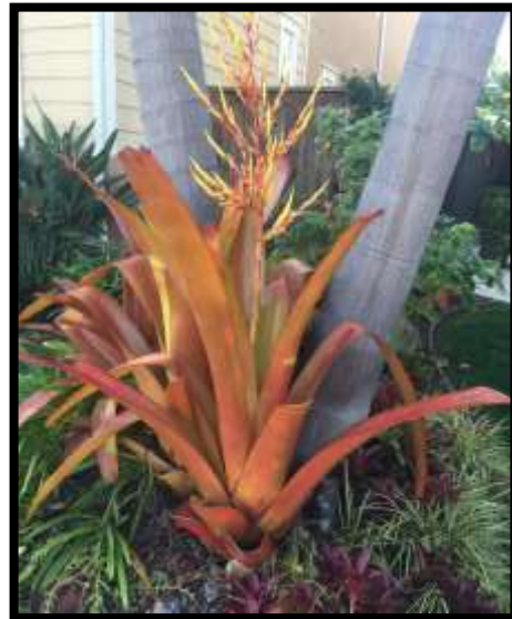
Aechmea blanchetiana gets the richest orange color.