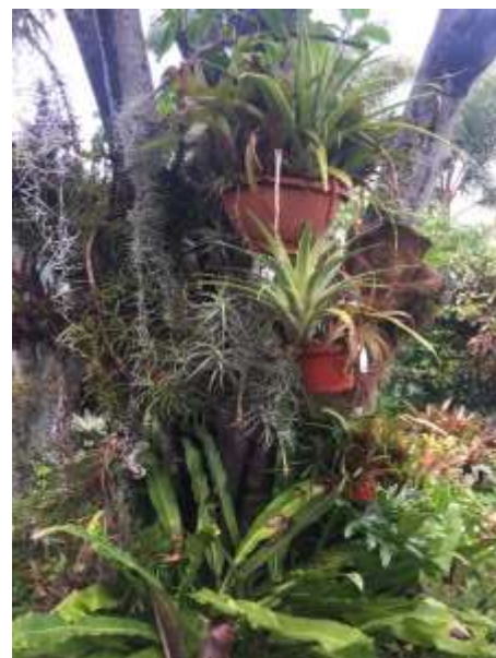
The trunk of this tree is covered in tillandsia

exceptional for their salt tolerance. He also pointed to some rare tillandsias that he has grown from seed. The collection was built up in a number of years; one could say these plants are survivors in a long term experiment.