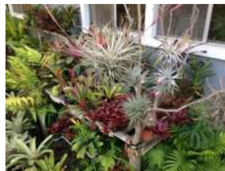
Tree display with assorted tillandsia and Neo. fireball