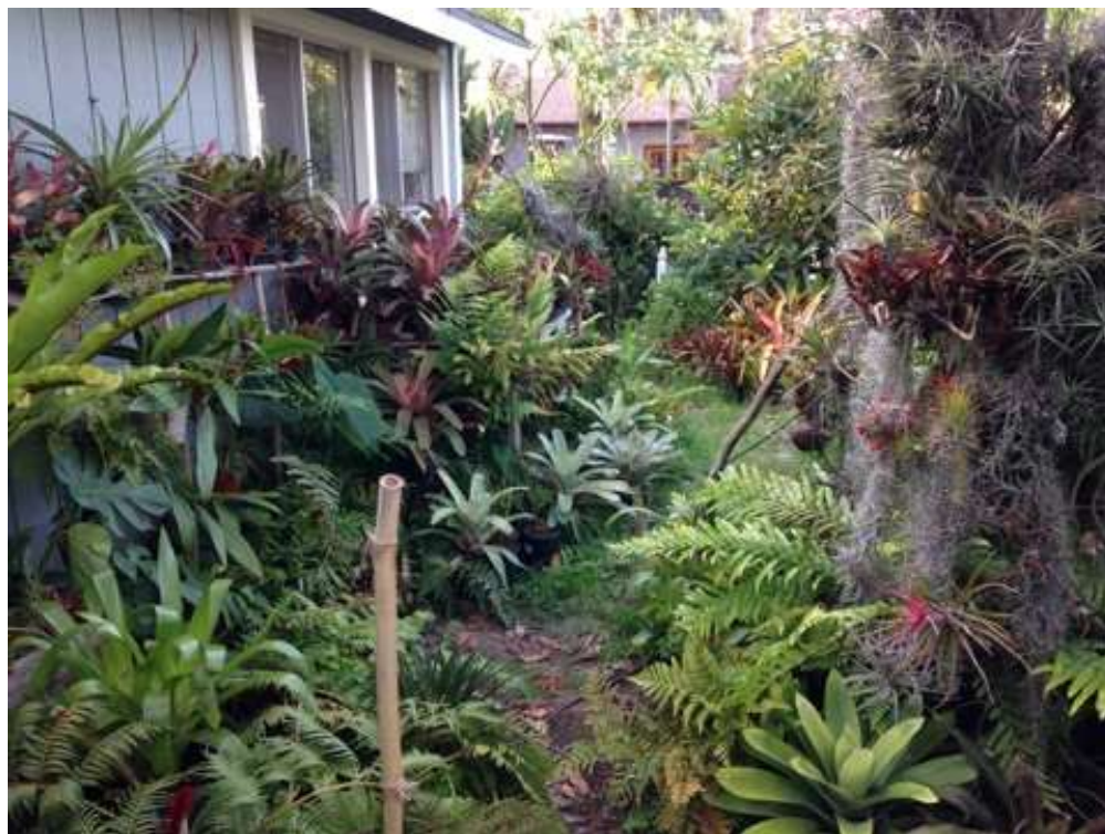
Overview of Justin's Garden.