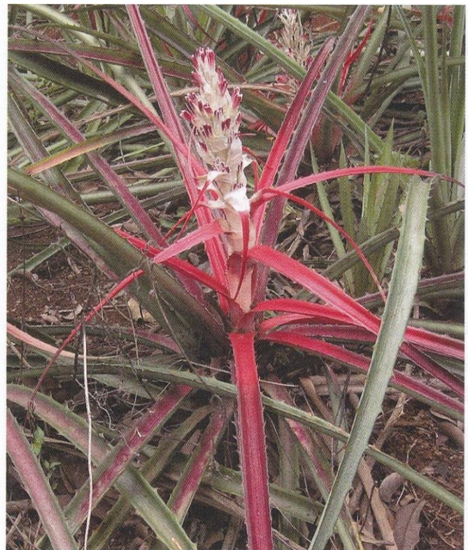
Figure 3. A flowering specimen of Bromelia tocanthinense at the type locality with a dense inflorescence.

For all you who have made it to the end, I figured you deserve some modest reward, so here are some pictures of Bromelias . From the latest Bromeliad Journal here is B. tocanthinense . J Brom Soc 65(1) at 60, 2015.