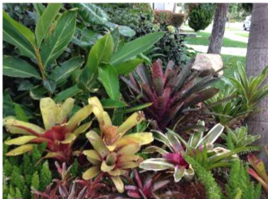
Aechmea 'rajah', vriesea hybrid, assorted Neoregelias with ginger and asparagus ferns in garden bed.

Yes, bromeliads might be too expensive to use outdoors, where it's survival of the fittest. Here at home, hazards include trampling by children, scorching by leaf blower, poisoning by dog urine, and mysterious critters that eat spiny plants. There are nightmare scenarios: The unlikely threat of a winter frost haunts my dreams. God forbid we have the hot dry Santa Anna winds... Plus, I find there's a lack of literature in growing