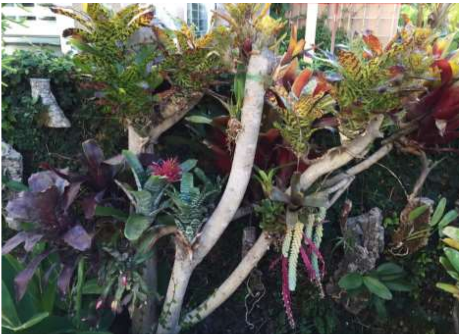
It's amazing how much you can pack into a 6-foot epiphyte tree. From top: A. correia-araujoi , Billbergia 'brimstone' , A. fasciata purple and regular, A. chantinii , orchids, epiphytic cactuses, donkey tail. these guys in their natural range.

In Brazil, they will grow on rooftops, fence posts. At first the poor plant got sunburns. Now into the third