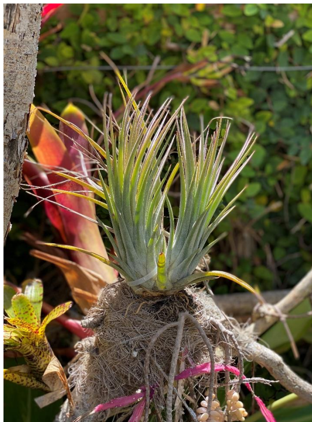
Tillandsia fasciculata x ionantha .

Now that we've been having some warmer weather, don't forget to dump out and replenish the water of