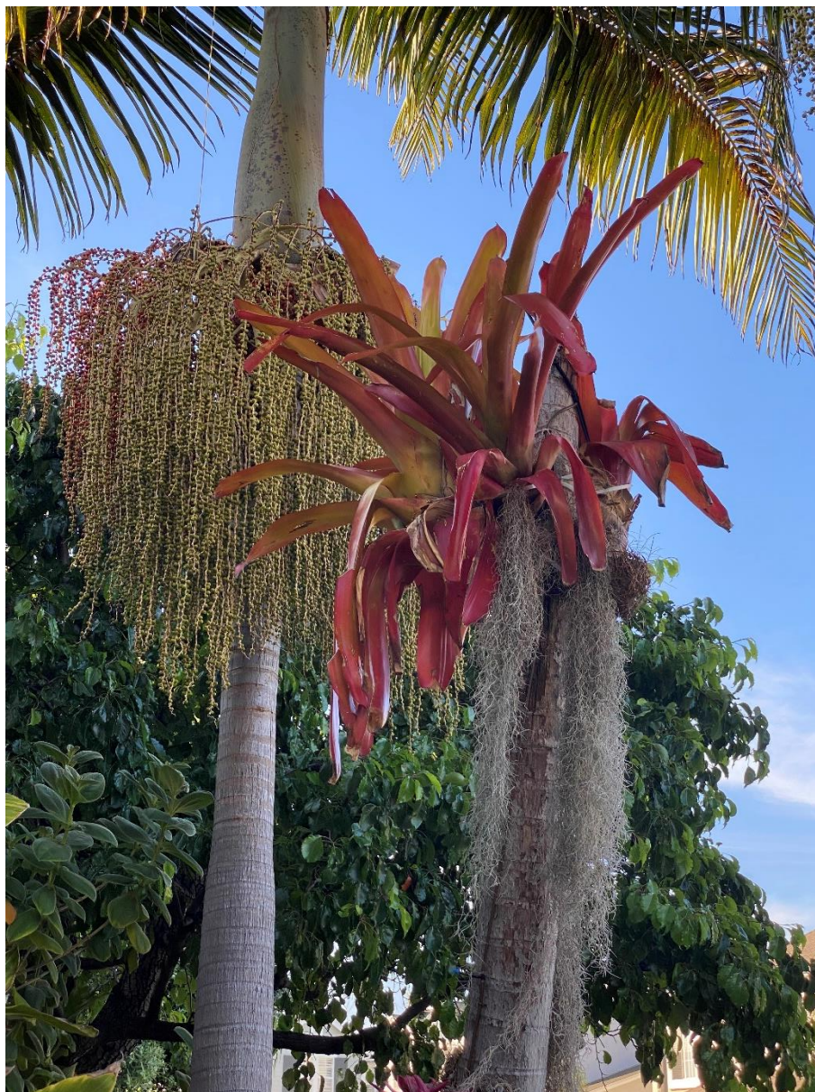
The blanchetiana tree in my front yard. The plant in the middle is the Wally Berg I just added.

I finally got around to going up my blanchetiana tree – a dead king palm that I outfitted with a crown of Aechmea blanchetiana orangeade - and do some much needed clean-up. It was looking pretty shaggy after all the rain and wind that beat up on it recently. Dead leaves were trimmed, and the plants that were tilted were secured. Found two empty birds nests up there, which I was careful not to knock down. Overall, I'm glad to see that the plants are pupping, even in the adverse conditions. I added another blanchetiana to the ensemble, this time a 'Wally Berg'.