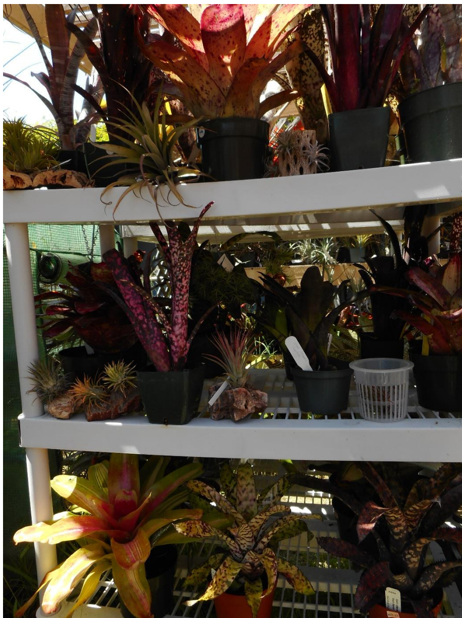
Neatly stacked broms in Morlane O'Donnell's collection.