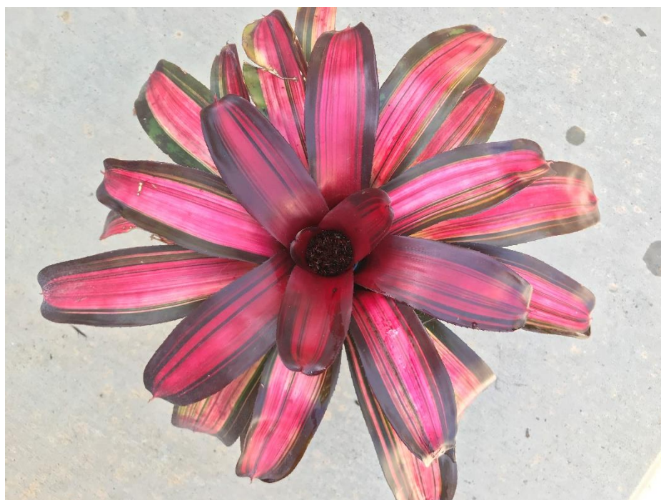
Check your neos for stagnant water in the cups

I'd like to thank everyone who has served on a committee or two last year. Please consider serving again. If