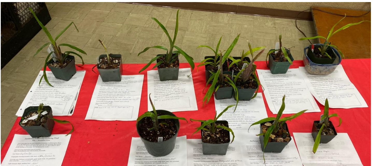
Aechmea brevicollis seedlings after 6 months