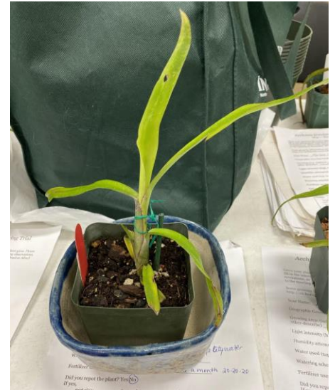
A. brevicollis seedling

After growing our Aechmea brevicollis seedlings for six months, the participants in our growing trial brought the plants in for comparison and discussion. With the information sheet from each grower, we could see just how some methods of culture produce slightly different results in the plants as well as the simply genetic differences in a group of seedlings. Thanks to all the participants. There seemed to be a consensus that we should bring them back in 2020 perhaps at the May meeting (that would be a year) to see how they all got through the winter and are progressing.