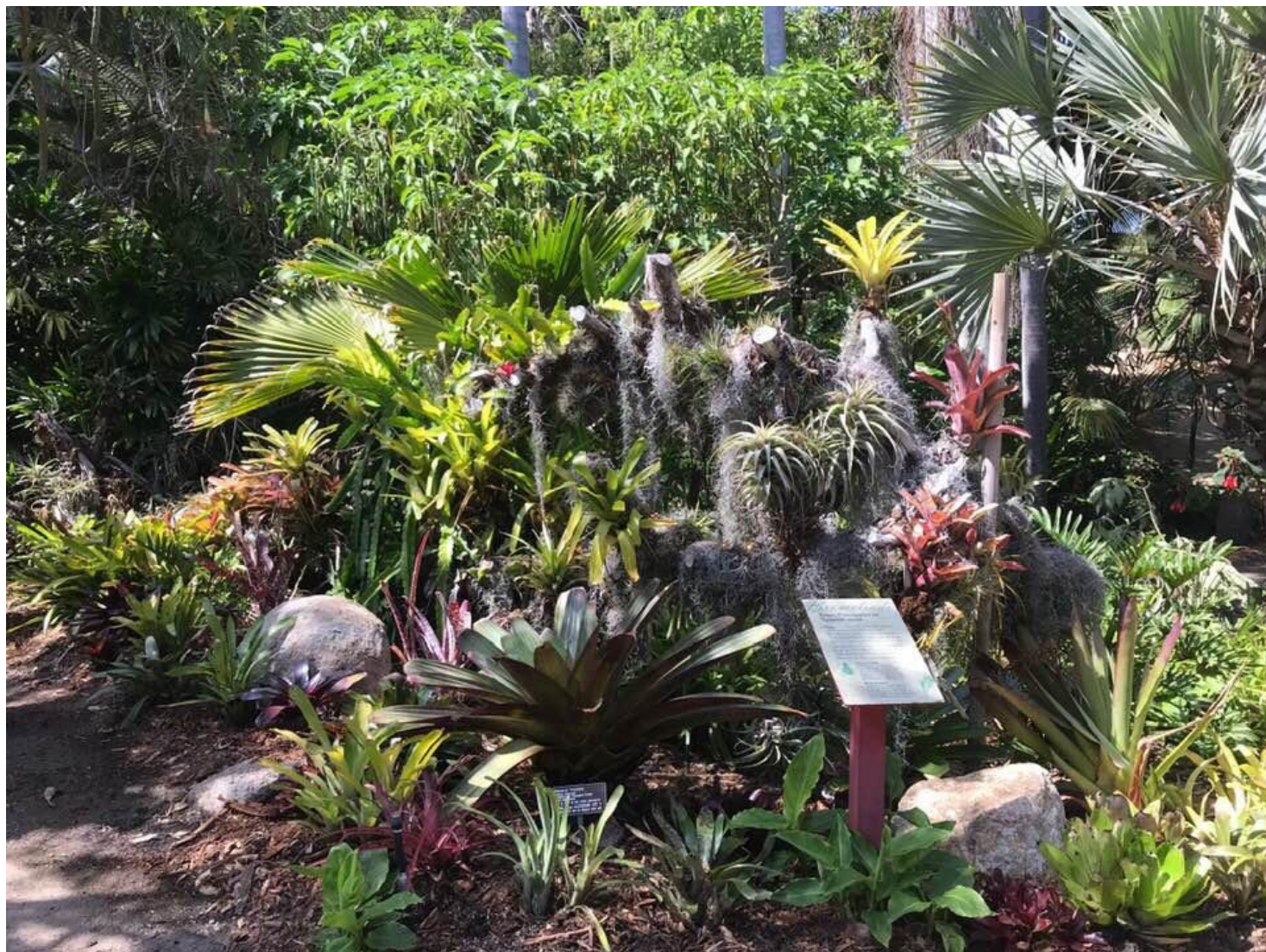
Bromeliad display at SDBG

I will be accepting your donations at our September meeting in Balboa Park. Plants should be in good condition. Got questions? Ask me about it at the picnic or send me an email at Scott.Sandel@outlook.com .