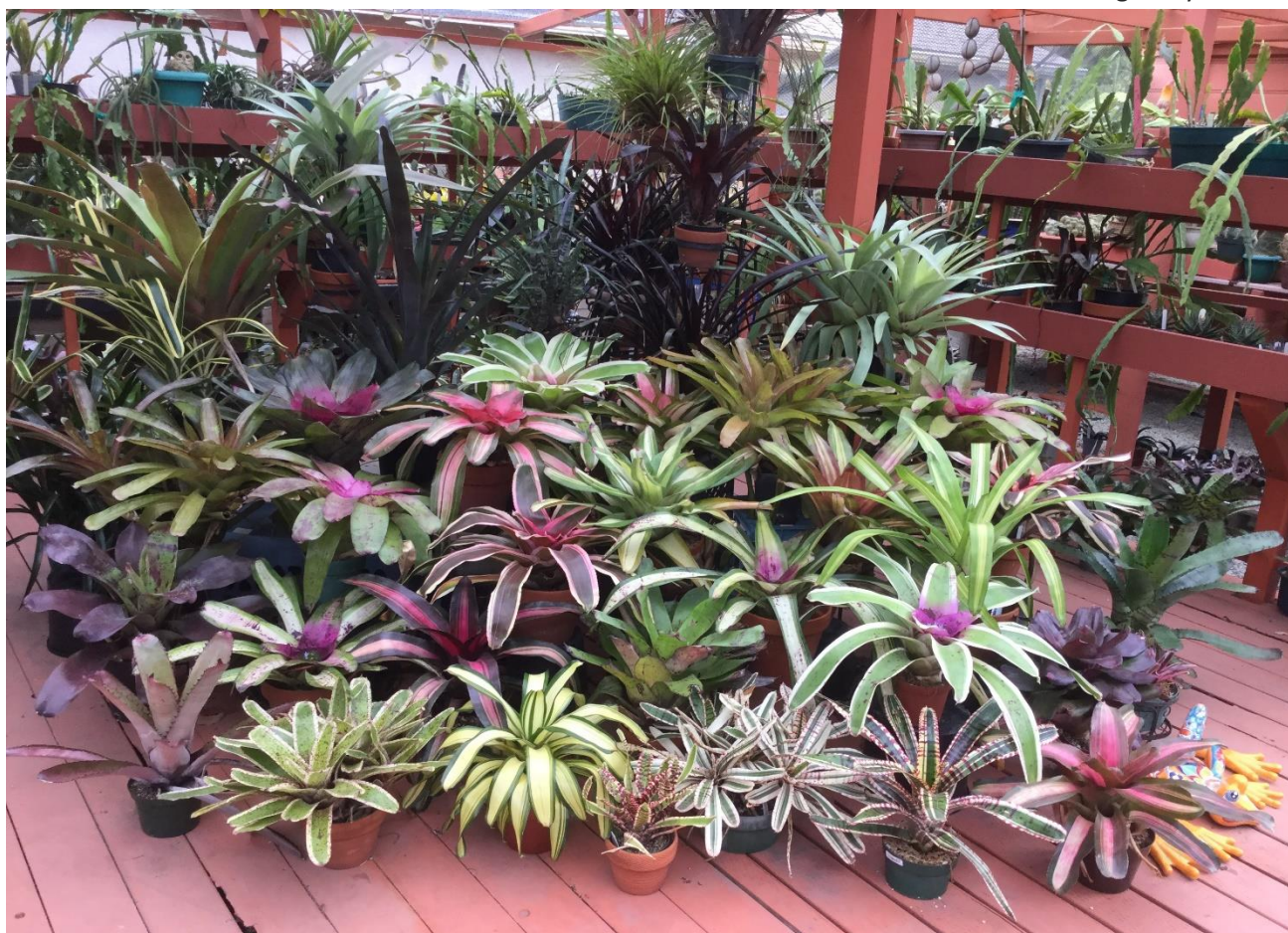
A view of Don's bromeliad collection