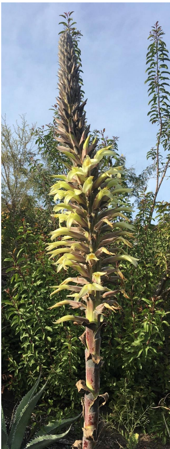
Detail of the inflorescence of Puya lanata