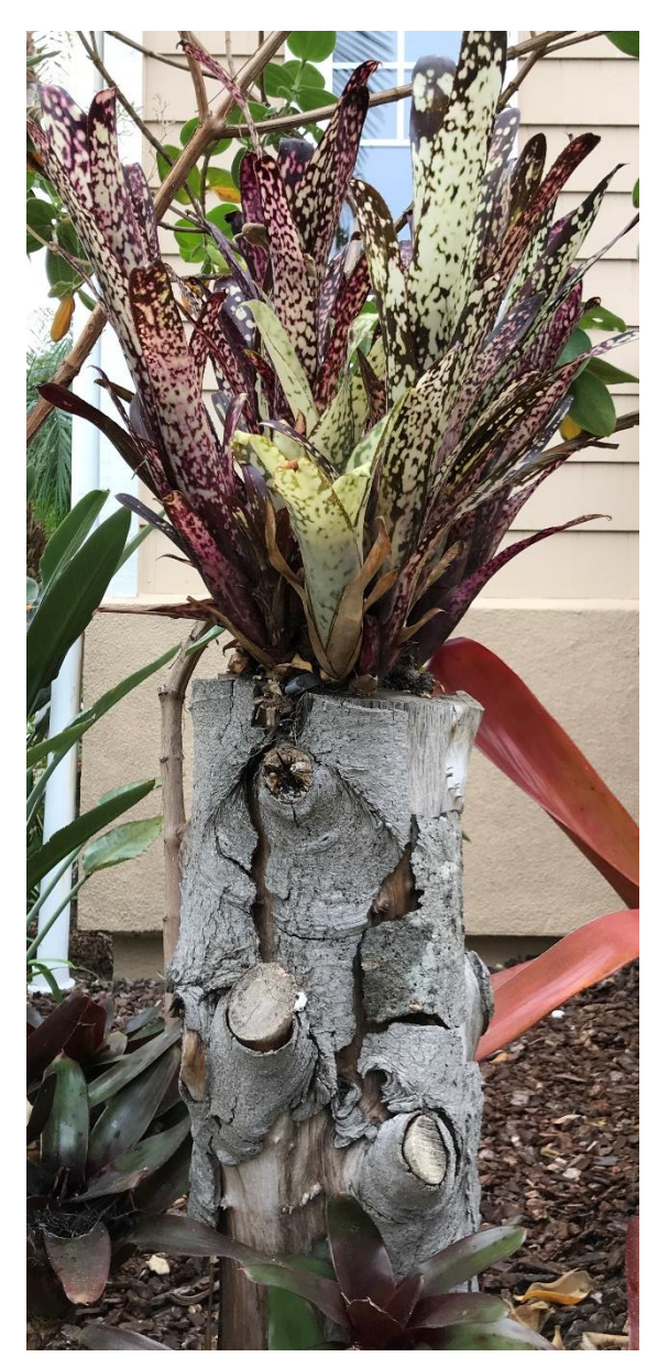
Billbergia 'Hallelujah' and 'Mariposa' sharing space on a log.

I look forward to seeing many of you this weekend. Some of you I will be seeing Saturday, since Bird Rock Tropicals is having their big holiday