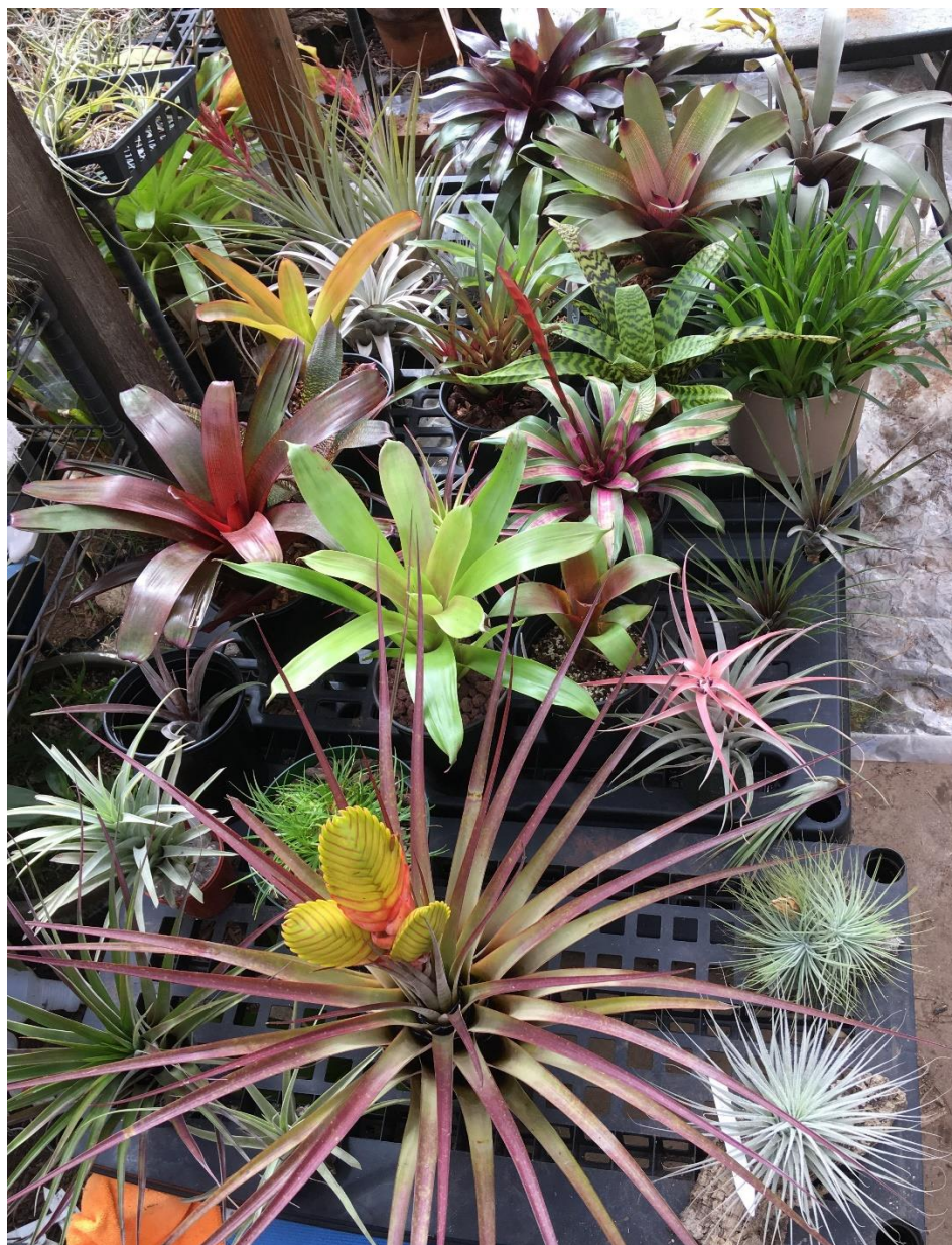
Sneak peek: September plant table

This month's plant table will be provided by David Kennedy. He's bringing an excellent batch of collector-type plants, and donating to the club 3 great auction plants. To top it off, Dave will also have plants for sale - SDBS gets 20%.